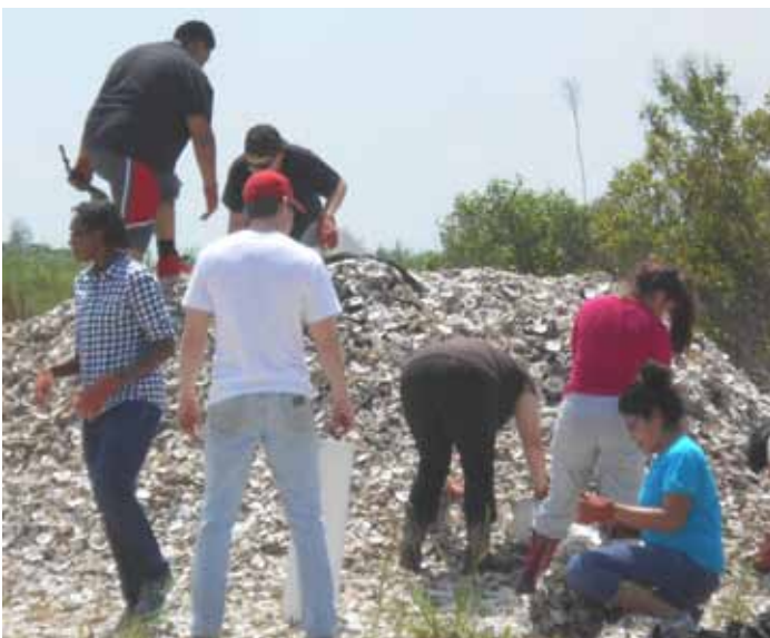
Youth in Houston stuff bags of recycled oyster shells for shoreline placement to protect marine life in Galveston Bay.

One of the goals of GYSD is to increase the visibility of youth service. The TJJD coalition partners accomplished this goal with more than 12 newspaper articles and the participation of 31 elected officials, including State Representative Jose Menendez and U.S. Congressman Beto O'Rourke.