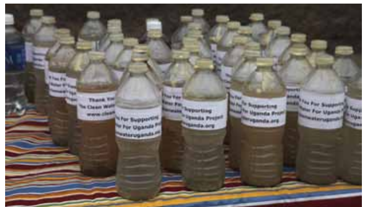
In their "Clean Water for Uganda Project", Houston youth thanked contributors to well-restoration project by giving them bottle of muddy water and bottle of clean water.

A full report on TJJD's Lead Agency results can be requested from Tammy.Holland@tjtd.texas.gov . ■