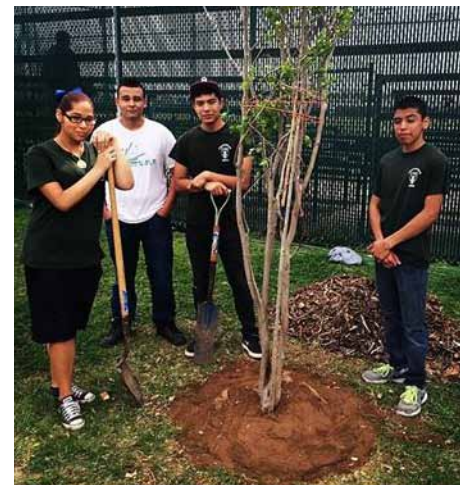
In San Antonio, John F. Kennedy High School JROTC cadets plant crape myrtle tree.

Together, the TJJD coalition partners implemented 83 service-learning projects and engaged 2,265 youth in