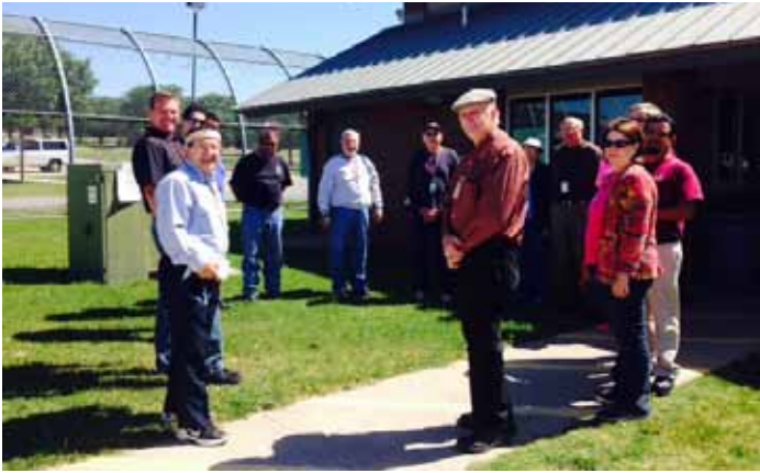
Volunteers circled up just inside the Gainesville security gate to pray for youth, staff, and the whole campus.

youth requested prayers for themselves, and their friends and family members. Volunteers from various religious denominations participated and ensured every youth had the opportunity to participate. Volunteers also led a special group activity for the youth in the security unit. This was the first year for the Evins facility to commemorate NDP and Chaplain Alvarado remarked, “This was a good day and program for our volunteers and youth at Evins. We hope that next year we can get more people involved from the community to share their experiences with our youth.”