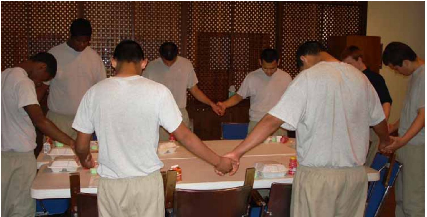
Giddings youth join in prayer before their weekly Bible study group.