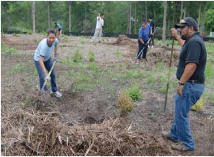
Travis County Juvenile Probation Department youth and staff participated in a service learning project at the Mobile Loaves & Fishes Community First! Village. They worked on developing the land and gardens of what will become a sustainable home and supportive community for individuals who have been chronically homeless.

service. These youth contributed 11,450 hours of service to 105 local communities across the state. An estimated 53,147 Texas citizens benefitted from these service projects that focused on significant social issues, such as human trafficking, health, education, environment, hunger, poverty, homelessness, human rights, animal welfare, veterans, and disaster preparedness.